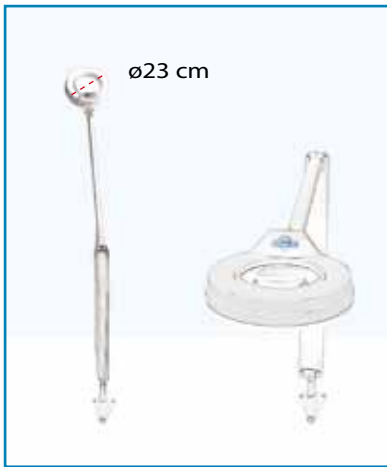
Wall mounted code CH/CIR/R/102

CIRCLELED is available trolley mounted or wall and table mounted provided with a simple clamp.