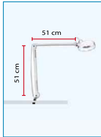
Table mounted code CH/CIR/R/103